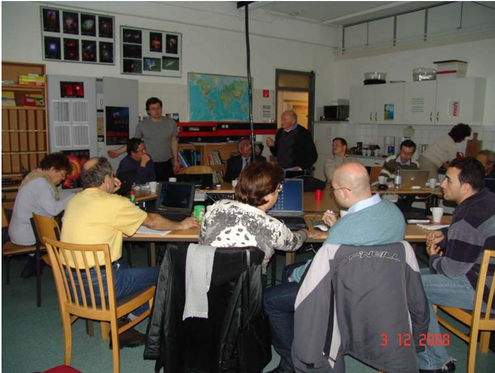
Figure 2 Meeting of NMDB collaboration at Christian-Albrechts-University at Kiel, December 4, 2008

The attention of NMDB collaboration was attracted to the new created SEVAN particle detectors networks. In the same time when the meeting was held a group from YerPhI was installing SEVAN detectors in Bulgaria and Croatia. SEVAN detectors measuring simultaneously charged and neutral fluxes of cosmic rays have serious advantage upon neutron monitors and will be used both for the solar physics basic research and for the forecasting geomagnetic and radiation storms securing multibillion investment of civilization in space exploration.